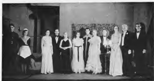
1929-Death Takes a Holiday-March, 1932*